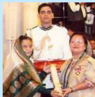
Padmashree Binny Yanga Highest Civilian Awardee