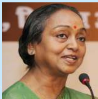
Mrs. Meira Kumar Former Parliament Speaker