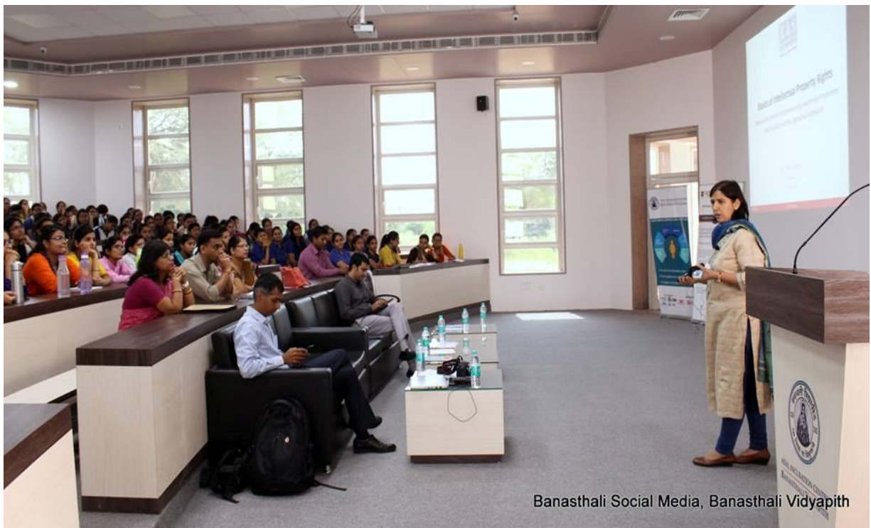
A 2 days workshop on Intellectual Property Rights (IPR) was conducted on 29<sup>th</sup> -30<sup>th</sup> December, 2018. with support from <u>Cell for IPR Promotion and Management (CIPAM)</u> for more than 250 Faculty Members and Research Scholars at Atal Incubation Centre, Banasthali Vidyapith. The workshop covered various aspects of IPRs including IP Tools, Patents, Design, Trademarks, Brand building, Copyright, etc.