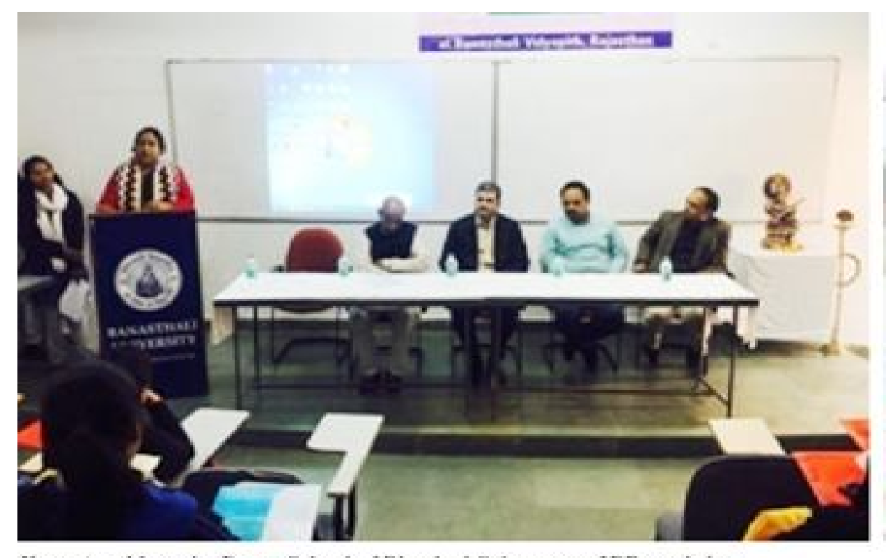
Keynote address by Dean, School of Physical Sciences on IPR workshop

Department of Electronics organized one week Faculty Development Programme on 28<sup>th</sup> July 2017 to 3<sup>rd</sup> Aug 2017 on the topic "Contemporary Applications and Opportunities in Research and Technology".